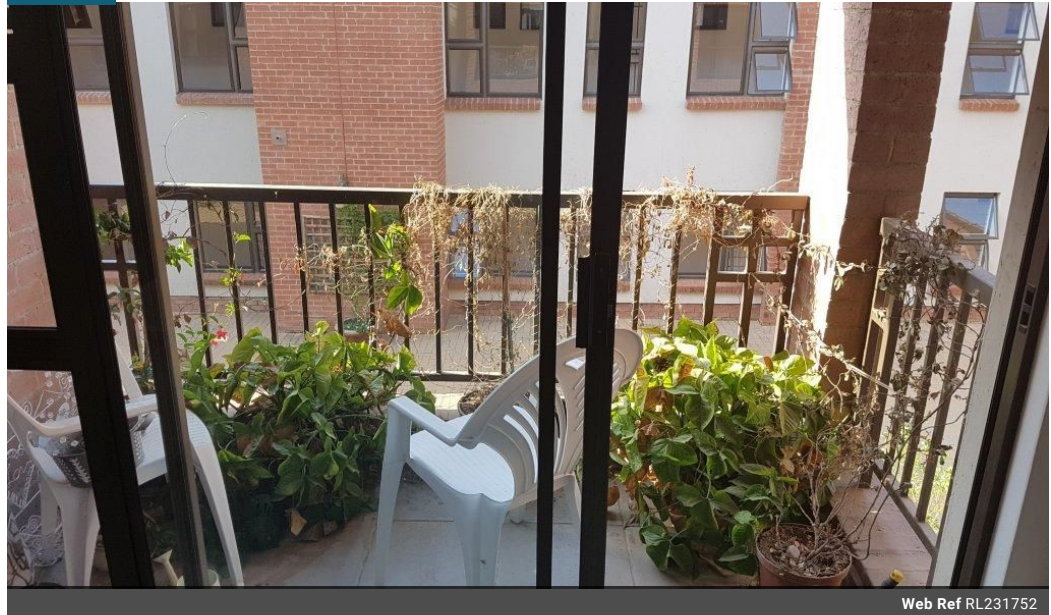
Web Ref RL231752