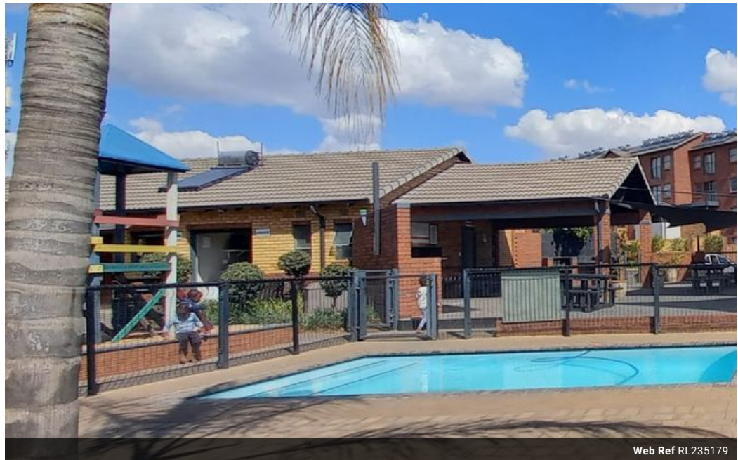
Web Ref RL235179

Third Floor Office Block F Hertford Office Park 90 Bekker Rd Vorna Valley Midrand