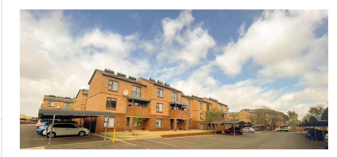
Web Ref RL234902